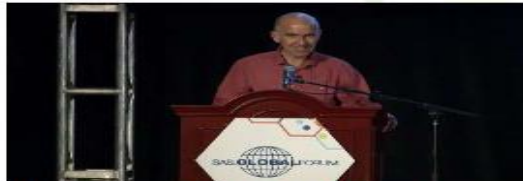
Missing Data: Overview, Likelihood, Weighted Estimating Equations, and Multiple Imputation Geert Molenberghs 00:51:59